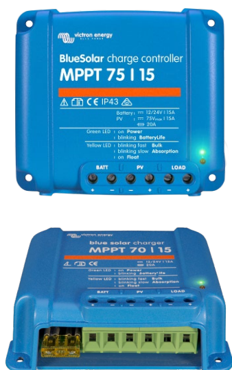
Solar Charge Controller MPPT 75/15