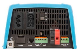
MultiPlus 500 / 800 / 1200 / 1600 VA