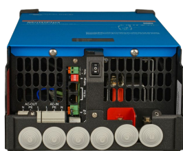
MultiPlus 2000 VA (bottom cover removed)