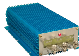
Orion IP67 24/12-100 Orion IP67 12/24-50