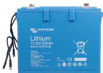
12,8V 330 Ah LiFePO4 Battery