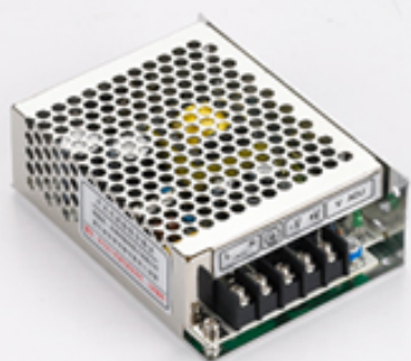
CASE: P16-12 111x78x36mm