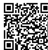
Smart Life Google Play

The product is covered by a declaration of conformity in accordance with the applicable regulations. On request from the manufacturer: info@solight.cz , or downloadable from www.solight.cz . This product contains a light source which for design reasons cannot be removed for verification and therefore the whole product is considered to be a light source.