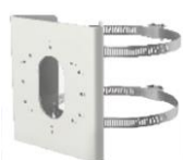
DS-1275ZJ-S-SUS Vertical Pole Mount