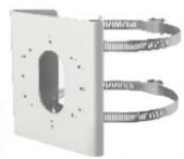
DS-1275ZJ-S-SUS Vertical Pole Mount