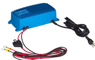
Blue Smart IP67 Charger 12/25