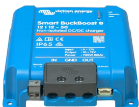
Smart BuckBoost DC-DC Charger non-isolated 12/12-50 connection area