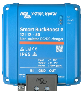
Smart BuckBoost DC-DC Charger non-isolated 12/12-50