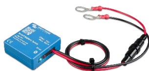
Smart Battery Sense Enables temperature and voltage compensated charging.