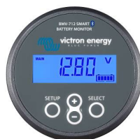
BMV-712 Smart Battery Monitor