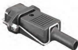
Retainer clip (included)