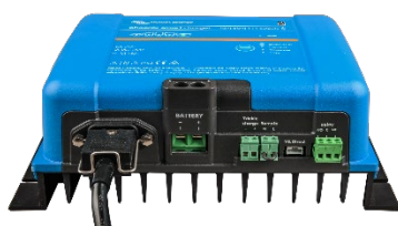
Phoenix Smart 12/50(1+1)