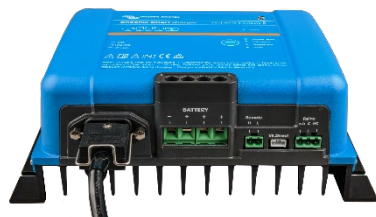
Phoenix Smart 12/50(3)