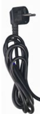
AC cord (must be ordered separately)

Plug options: Europe: CEE 7/7 UK: BS 1363 Australia/New Zealand: AS/NZS 3112